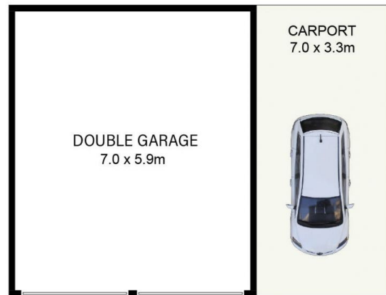
GARDEN SHED (NOT SHOWN IN ACTUAL LOCATION / ORIENTATION)