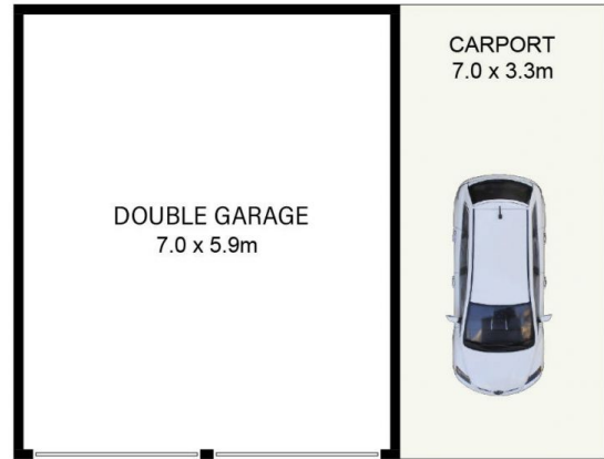
GARDEN SHED (NOT SHOWN IN ACTUAL LOCATION / ORIENTATION)